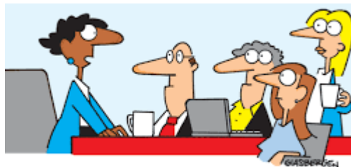
"A motion has been made and seconded that this be one of those meetings where nothing actually gets done."